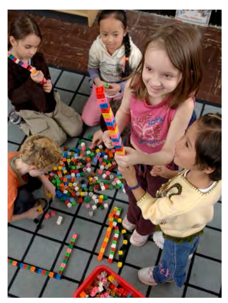
Children collaboratively build a tall tower out of Unifix cubes.

From age five to seven, many children demonstrate rational counting. They may know that counting means assigning one number word to each object (one-twothree . . . ), showing they understand oneto-one correspondence. They know that the final count number indicates the number of objects in a set (cardinality). From approximately age five to eight, children demonstrate strategic counting when they count on from a given number. Counting back may be more challenging for young learners, and they may need many opportunities to practise counting back from different numbers. Strategic counting will later help children to develop addition and subtraction concepts (Manitoba Education and Advanced Learning, Kindergarten Mathematics 4).