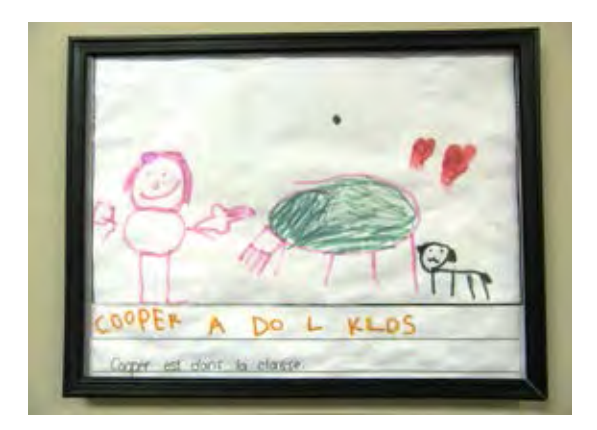
A child in a French Immersion Kindergarten can spell "Cooper" because her dog is important to her. This picture shows her dog Cooper coming for a visit to Kindergarten.