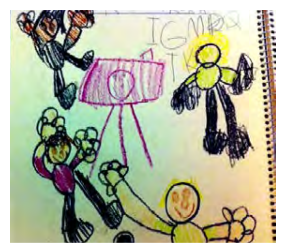
The child has written the first letter and/or key sound of each word in his sentence. (I got my picture taken.)

random way. However, children may demonstrate an understanding that language can be written down and that it moves from left to right and top to bottom on a page. There may be a mix of upper- and lower-case letters, and some of the symbols may be repeated many times. It is clear that children do not need to know all the letters and sounds before they begin to write.