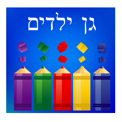
A child who learns to read Arabic or Hebrew will learn to read from right to left; a young reader of Chinese will read from top to bottom, rather than across the page from left to right.