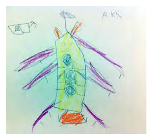
The child has the beginning and middle sound "RKK" (rocket).