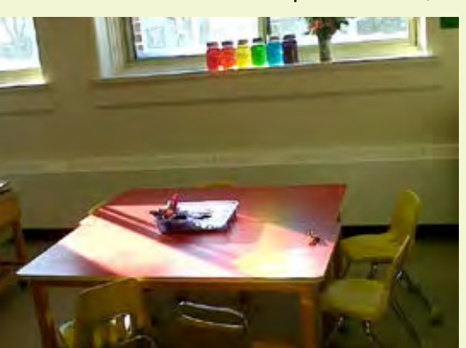
The sunlight shines through the jars filled with coloured water, creating rainbows in the classroom.