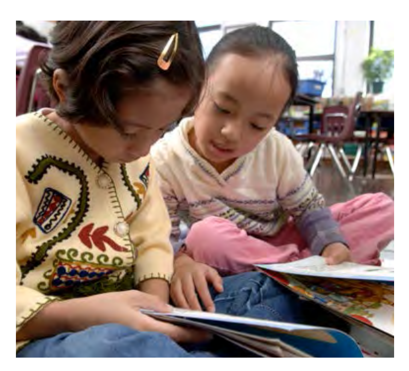
Two girls read together.