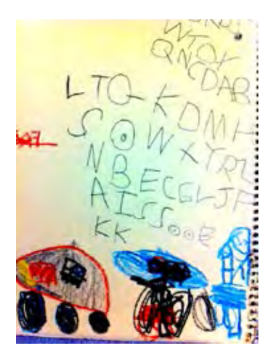
The child has written random letters.

As emergent writers, children's attempts to write may be little more than a few purposeful scribbles on a page. However, when you demonstrate, share the task, and