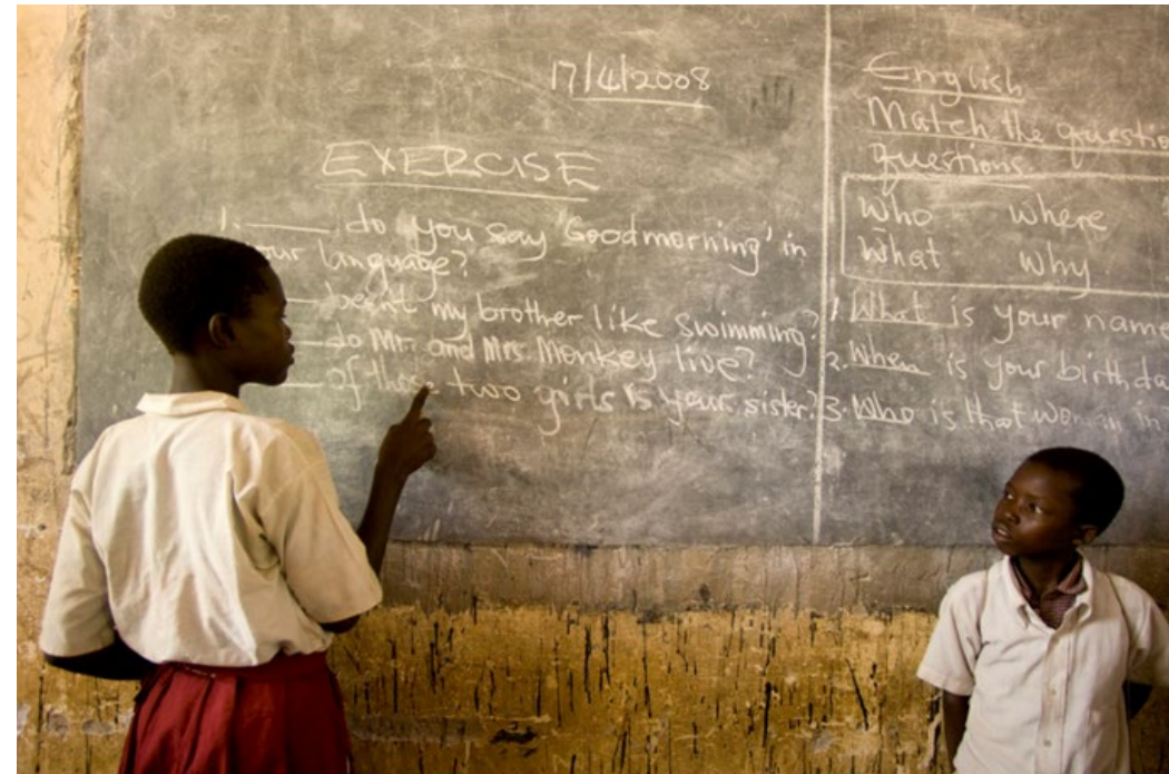
April 2008. UNHCR News Story: Uganda: The Gift of Education. Siripi Primary School in Rhino camp refugee settlement in Arua. Most of the students are refugees who fled the decades long civil war in Sudan. < https://www.flickr.com/photos/unhcr/4598181832/ >. Used with permission. All rights reserved.

The narratives that follow speak to the effects of war on new Canadians of war-affected backgrounds and their experiences in rebuilding their lives in Manitoba, with an emphasis on their educational experiences and pathways. To a large degree, they attest to the resiliency of such children, the healing that has taken place, and their hope for their future.