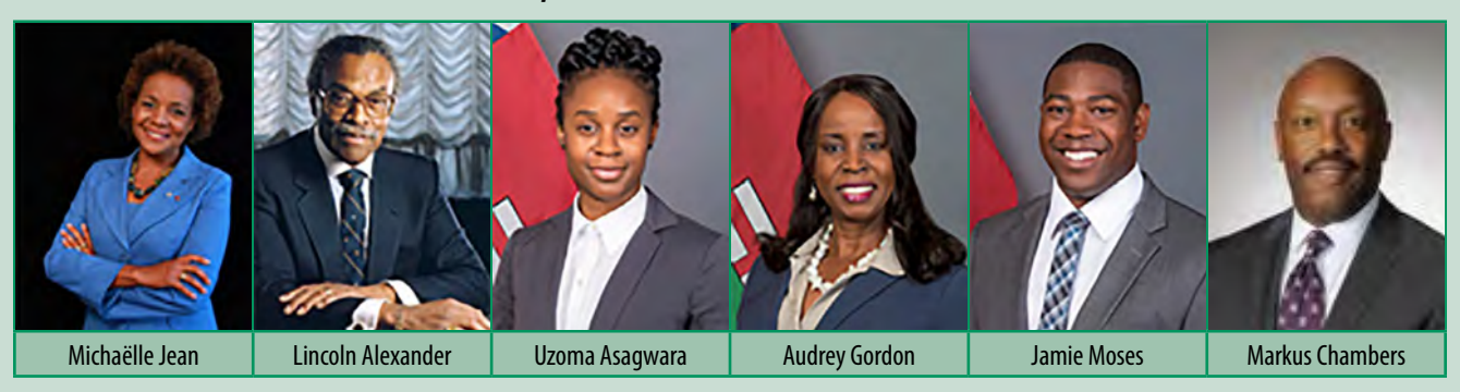
Firsts: Black Elected Officials and Representatives of the Queen

These six Black Canadians made history by being "first" in several categories of elected or appointed officials nationally or in Manitoba, breaking colour barriers that had existed in Canada's parliament, legislatures, and councils. From left to right they are as follows: