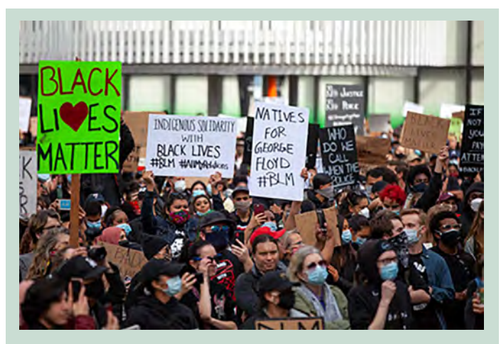
Black Lives Matter Protest, Vancouver May 31, 2020

Anti-Racism Education in Canada: Best Practices (https://cfrac.com/publications/anti-racism-education-in-canada-best-practices/) This 2013 report is from the Centre for Race and Culture. It provides a summary of best practices as well as examples of current initiatives in anti-racism education in several Canadian cities. The report contains information that is useful for any teacher, administrator, or individual interested in promoting equitable teaching and learning.