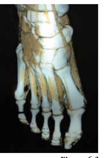
Figure 6-3 A bone scan done with a tracer of radioactive strontium. In this image, bones can clearly be seen along with tendons.

What are the effects of thallium poisoning on the human body? In what everyday products can thallium be found?