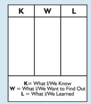
The KWL Chart