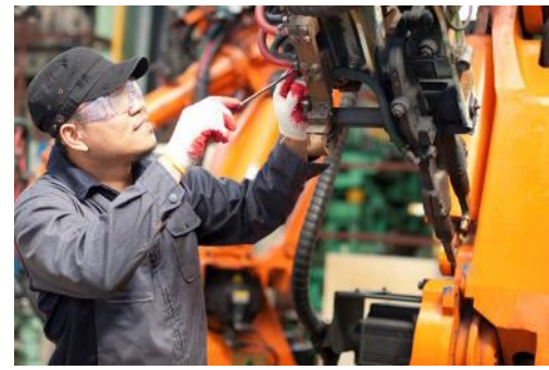
Heavy Duty Equipment Technician