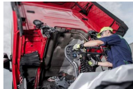
Truck & Transport Mechanic