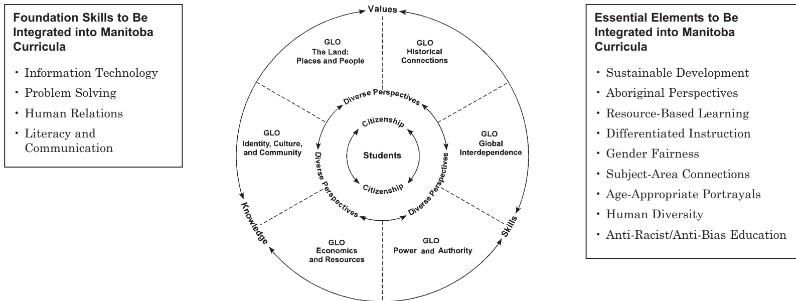
Conceptual Map of the Framework

The student learning outcomes presented in this Framework address the foundation skill areas and other essential elements common to all Manitoba curricula ( A Foundation for Excellence ). The following conceptual map illustrates these and other key components upon which Manitoba social studies curricula are based.