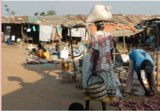
© Jack Welsch/Panoramio. February 2, 2013. Wudu Market, Kajo Keji. < www.panoramio.com/photo/85552921 >. Used with permission. All rights reserved.

Kuku. < www.gurtong.net/Peoples/PeoplesProfiles/Kuku/tabid/203/Default.aspx >.