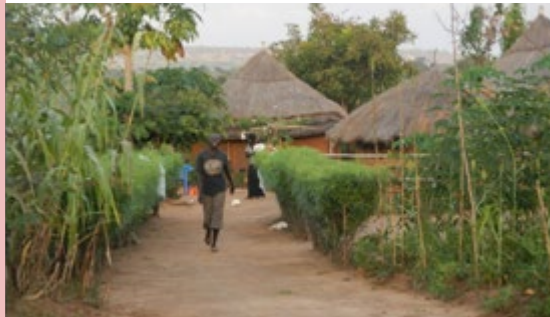
December 18, 2012. Wecome, Kajo Keji.