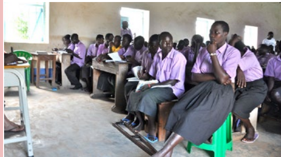
© The Water Project. Kajo Keji Secondary School. < http://thewaterproject.org/community/projects/sudan/new-well-sudan-201 >. Used with permission. All rights reserved.