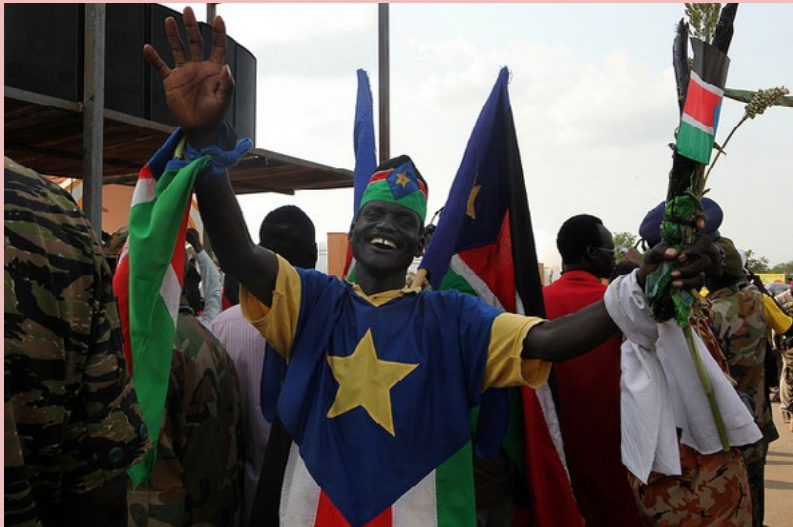
July 9, 2011. South Sudan Independence Day. Guests at the Republic of South Sudan Independence Day celebrations in Juba, South Sudan on July 9, 2011.

At first I was placed in the EAL program to improve my English language skills for most of the school day. After a while, I started taking some Grade 10 courses as well. At first it was difficult to adjust and fit in because the teaching style was very different from what I used to in Uganda. In Uganda we had large classes and we had to make an appointment with the teacher if we wanted help.