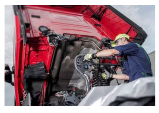
Truck & Transport Mechanic