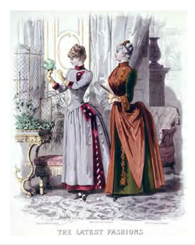
Living in the era of body piercing and tattoos, we need to adopt a historical perspective to understand why women of the past endured corsets and sported bustles.

Show students a sample of the English translation of Samuel de Champlain's journal to describe his voyage to Canada in 1603. "What would you do to try to understand the language written?" "What information do you get from the text pertaining to the customs of the time?" "What differences are there between the lives of First Peoples and those of the Europeans?"