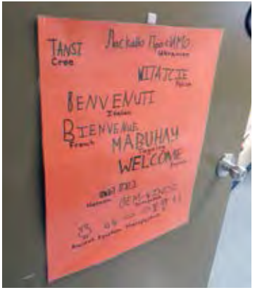
Families see a welcome sign in their first languages as they drop off their children at Kindergarten.

As a Kindergarten teacher, you recognize your integral role in facilitating optimal learning and development for children in a year that is either the beginning of their educational journey or the point of transition from child care, nursery school, or other settings to a school environment. You are also keenly aware that a collaborative partnership between teachers and parents and families throughout their children's Kindergarten year is essential to children having the richest possible learning experiences at school and at home. The relationship established with families is particularly important in this time of rapid change to Manitoba's social landscape due to the increasing diversity of families, with respect to culture, language, family composition, and so on. The new landscape presents opportunities and challenges for teachers, students, families, and communities, which are met most effectively through joint efforts focused on optimal outcomes for learners through strong home-school connections established in the first years of school.