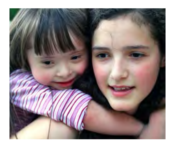
A mother and her child with exceptional learning needs.

Think about traditionally celebrated days such as Mother's Day and Father's Day, and be sensitive to the feelings of children who may have two mommies but no daddy, or the reverse. You might decide to celebrate National Family Week instead. Your genuine interest will foster caring and understanding between yourself and students, between you and parents, and among all students in the classroom.