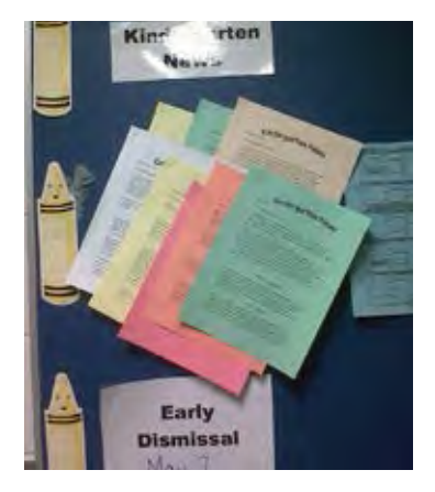
A Kindergarten News bulletin board outside the Kindergarten classroom provides families with current information as they drop off and pick up their children.