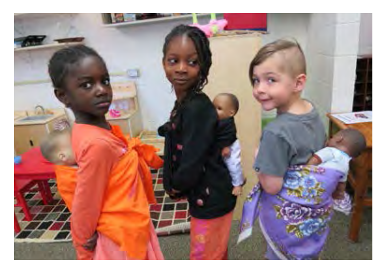
Mothers carrying babies on their backs is a common cultural practice across Africa. In response to one girl's request, swaths of fabric were used to tie dolls to the children's backs.

The diversity that is present in our land today and that will evolve in the future is seen not as an obstacle or a problem, but as a strength and a source of hope for the future. Respect for, or appreciation of, diversity has become the keystone that unites Canada and its people, and is often upheld as an ideal for the world as a whole.