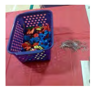
Kindergarten fairs often include play-based learning centres, such as this numeracy and literacy centre, which has magnetic letters and numbers and paperclips for children to count.