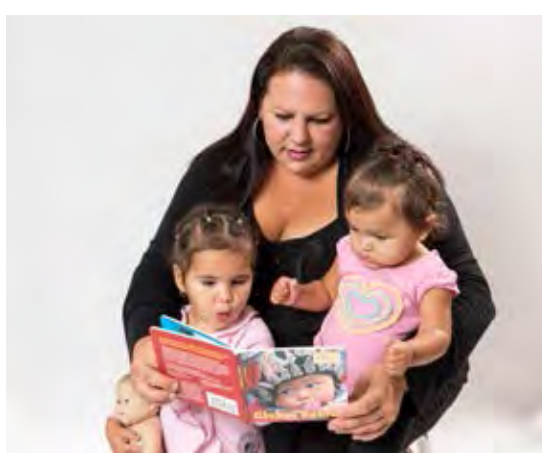
An Indigenous family enjoys storytime together.

According to census and Manitoba Health data, "Manitoba has a high percentage of Aboriginal families and children, and this diversity is growing. Aboriginal children under six (not including those who live in First Nations communities) represent 19% of all children under six in Manitoba, compared to 5% in Canada" (Healthy Child Manitoba, Starting Early, Starting Strong: Manitoba's Five-Year Plan 4). We welcome many First Nations, Métis, and Inuit children into our Kindergarten classrooms, and we