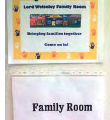
Families are invited to spend time in a special family centre established in many schools.