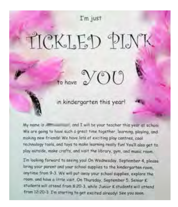
Children receive a letter from their teacher during the summer before Kindergarten begins. Used with permission of a Kindergarten teacher.

One Kindergarten teacher shared that during the June visits of new Kindergarten children, she takes a digital photo of herself with each child. During the summer, she writes a letter to each incoming child and includes the photo to help the child remember what she looks like. Children are thrilled to receive their own personalized mail from their new teacher, and this simple act helps reinforce what the children