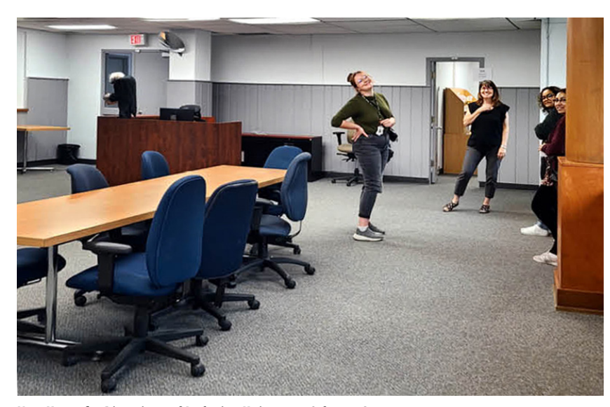
New Home for Diversity and Inclusion Unit at 210 Osborne Street

The department administers the Inclusion Support Program, which assists eligible child care facilities to address barriers that allow children with additional support needs and/or significant behavioural/ emotional needs to participate in programming and activities. The Inclusion Support